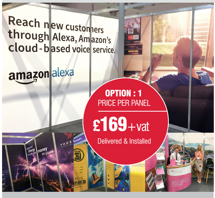
OPTION 1: Between The Poles / Non Seamless (you can see the shell scheme poles)

K Display Ltd are the ONLY Authorised Official Graphics Supplier to this exhibition. We also print the graphics for the organisers of this show, so please take advantage of the assurance and discounted prices they have negotiated on your behalf.